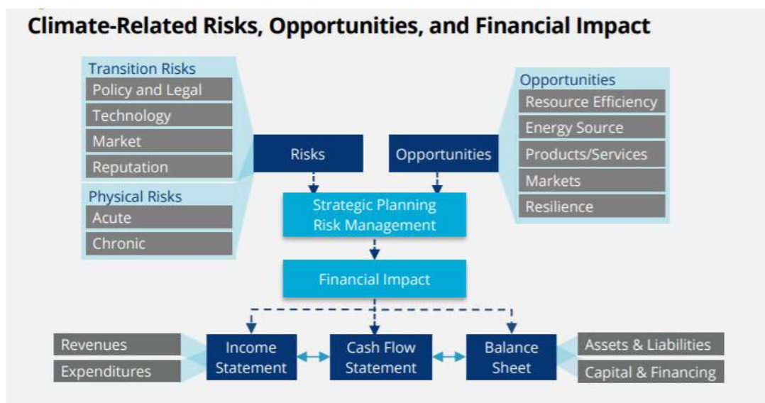
Figure 1: Climate-related financial risks to entities.

In 2018, the Bank of England Prudential Regulation Authority explained that these financial risks have distinctive elements. The risks are far-reaching in breadth and magnitude across the economy, involve uncertain and extended time horizons, are foreseeable, and – crucially – the magnitude of future financial risks depends in large part on decisions taken today. 4