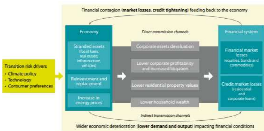
Figure 2: Climate-related systemic risks arising from transition risks. Source: NGFS Guide for Supervisors: Integrating climate-related and environmental risks into prudential supervision (2020) p. 13.

As businesses become visibly disrupted from the impacts of a changing climate and the transition to a net-zero emissions economy, the awareness of these financial and systemic risks has become squarely mainstream. In