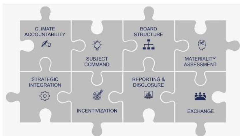
Figure 1: Guiding principles for effective climate governance on corporate boards

However, despite this growing awareness of the scale and urgency of the climate crisis, few directors possess the specific interdisciplinary skills necessary to effect this wholesale change of culture and behaviour. It is for this very reason that the Climate Governance Initiative (CGI) came into being: in 2019, the World Economic Forum unveiled the Principles for Effective Climate Governance , a comprehensive set of guidance principles that lay out best practice for boards and their directors in respect of the climate. To facilitate their promotion and implementation, local CGI “Chapters” have been set up around the world to serve as centres of expertise and venues for directors to exchange with each other as well as with a wide range of subject matter experts.