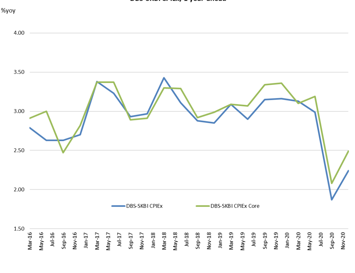
Figure 1: One-year-Ahead-inflation expectations: The chart shows the quarterly DBS-SKBI CPIEx (CPI-All Item) and DBS-SKBI CPIEx Core (Excluding accommodation and private road transportation components) One-Year-Ahead Inflation Expectations polled in the quarterly online Singapore Index of Inflation Expectations (SInDex) Survey conducted December 15-26, 2020.

2020, which means for respondent who prioritized life over livelihood, two were prioritizing livelihood over life.